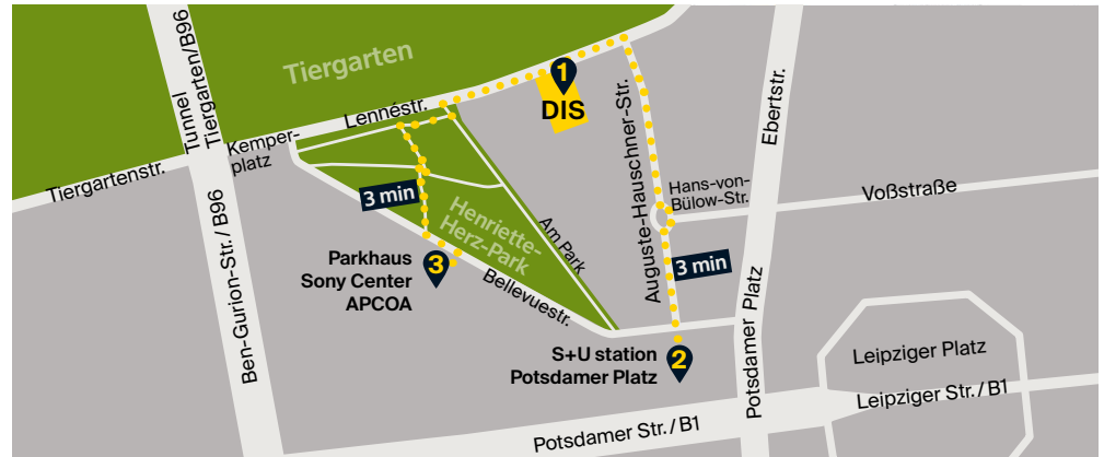
Footpaths to DIS: (1) from Potsdamer Platz S+U station (2) and from Parkhaus Sony Center APCOA (3) in Bellevuestraße 3

Further information can be found via this link: → www.bvg.de/en